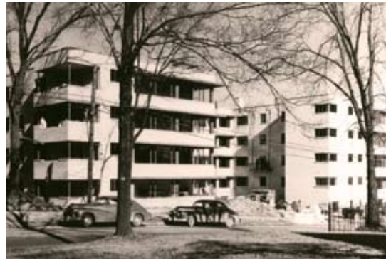
A photo of the construction, 1947

Constructed in 1947, in the popular art deco style, our community functioned until 1986 as a rental facility when the building was converted to condominium units, available for purchase.